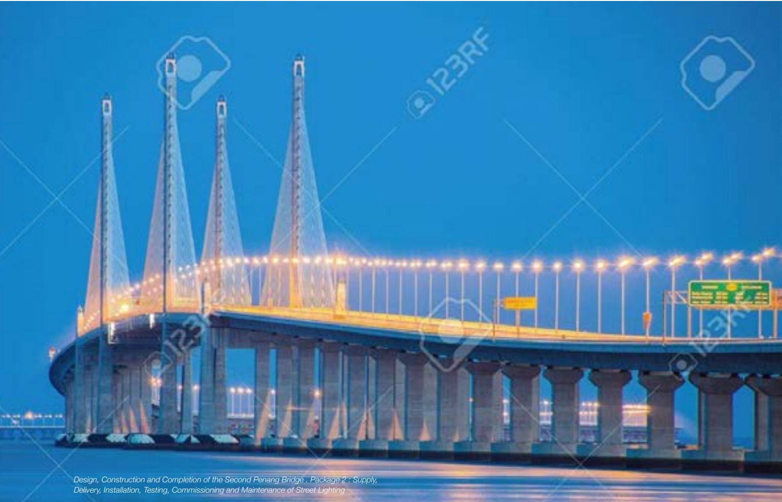
Design, Construction and Completion of the Second Penang Bridge. . Package 2 : Supply, Delivery, Installation, Testing, Commissioning and Maintenance of Street Lighting